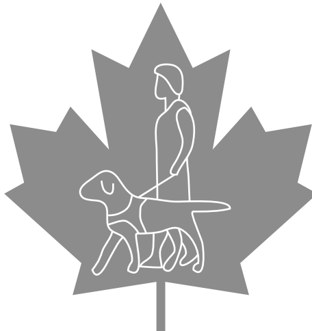
Official Symbol of Canadian Guide Dogs for the Blind

Guide dogs are trained to respond to simple commands, such as “Right,” “Left” and “Forward.” They will refuse only when obeying the command could lead their masters into a dangerous situation.